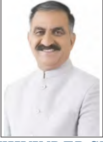
SUKHVINDER SINGH SUKHU सुखविंदर सिंह सुक्खू